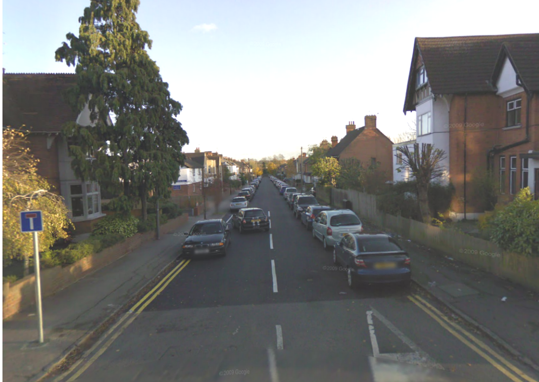
Figure 2 View from High Road